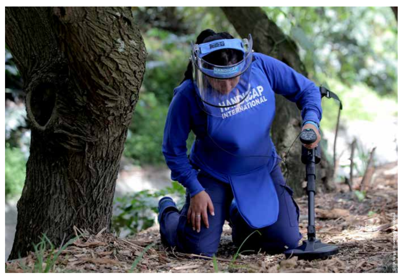
A woman trains to do demining work in Colombia