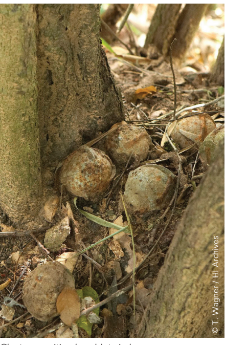
Cluster munition bomblets in Laos