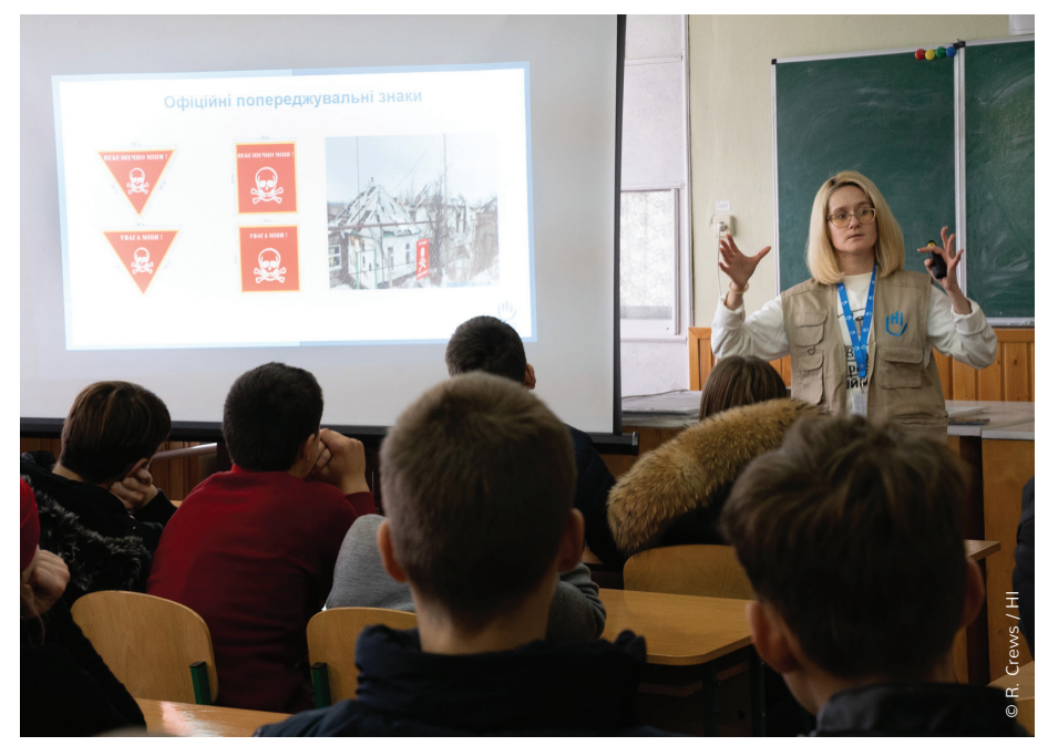
Ukrainian students attend an explosive ordnance risk education session with Humanity & Inclusion.

"The suffering will hit future generations," Meer adds. "They will live in fear of encountering these weapons and will bear the burden of clearing their land when American cluster munitions fail to explode on impact."