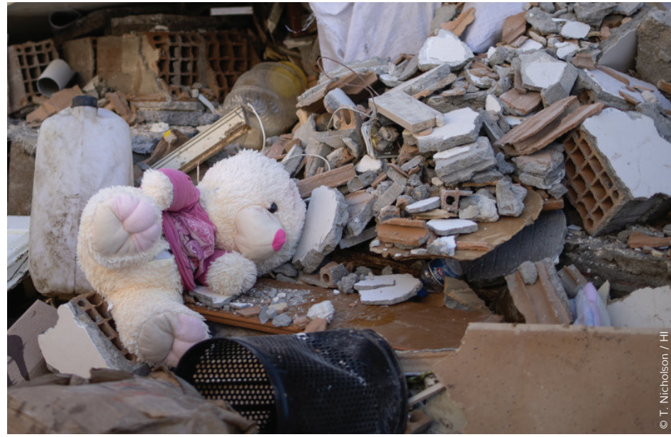
Left: Rema, 13, recovers at a hospital in northwest Syria. Right: Personal belongings are shown in debris from a collapsed building in Türkiye.