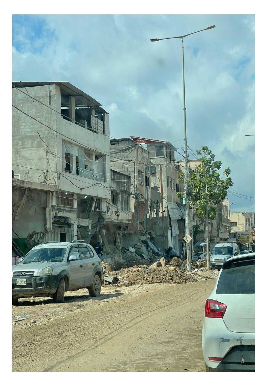
Nur Shams Refugee Camp, Palestine