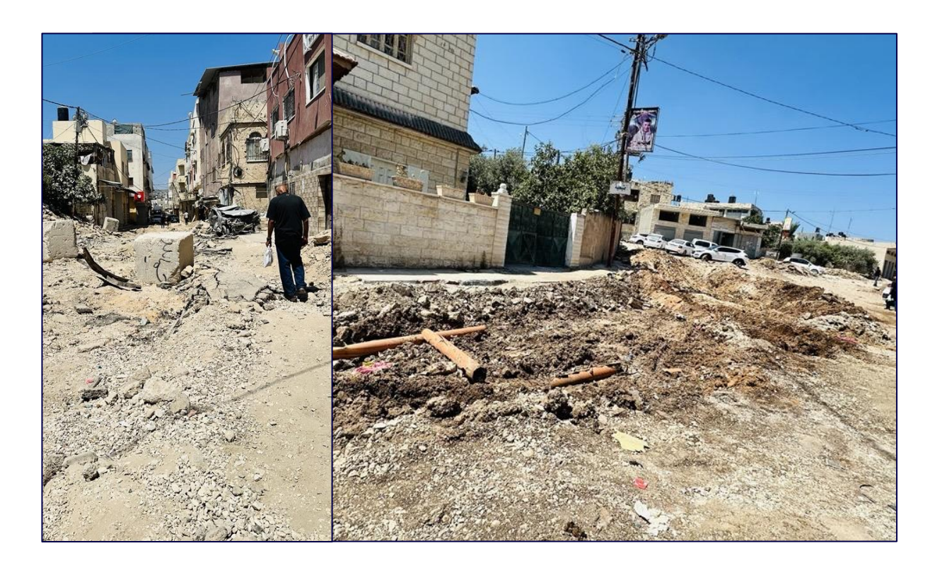
Jenin Refugee Camp, Palestine

Over obstacle: the lack of permit and evacuation. In Bethlehem, the number of patients of mobile clinic for artificial limbs run by the Bethlehem Arab Society for Rehabilitation in West Bank, including East Jerusalem, has been halved, as patients from Gaza can no longer reach the center for follow-up treatments or to change their prosthesis and orthoses, as they did before 7 October 2023. In the West Bank, displacement of the population that has been affected by destruction of houses disrupts further the continuity of care, making it challenging to access essential services and physical rehabilitation. According to OCHA, in the West Bank, over 6,800 Palestinians have been displaced between 7 October 2023 and 30 November 2024<sup>23</sup>. Plus, administratively, the West Bank is divided into Areas A and H1 in Hebron, Area B, Areas C and H2 in Hebron, and East Jerusalem; and Palestinian communities in Areas C and H2 of Hebron face additional barriers to health access, due to under-provision of services, restrictive planning policies that limit the development of health facilities.