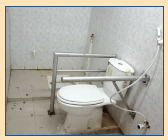
Door could open from inside, electric switch board placement was changed and high commode with handrail installed makinga health centre toilet of Sitakund Upazila accessible for person with disabilities