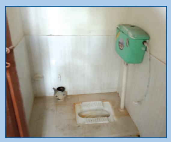
Inaccessible door-width and sitting arrangement of space inside a toilet in a health centre of Sitakund Upazila \ensuremath{\mathbb{Q}} HI