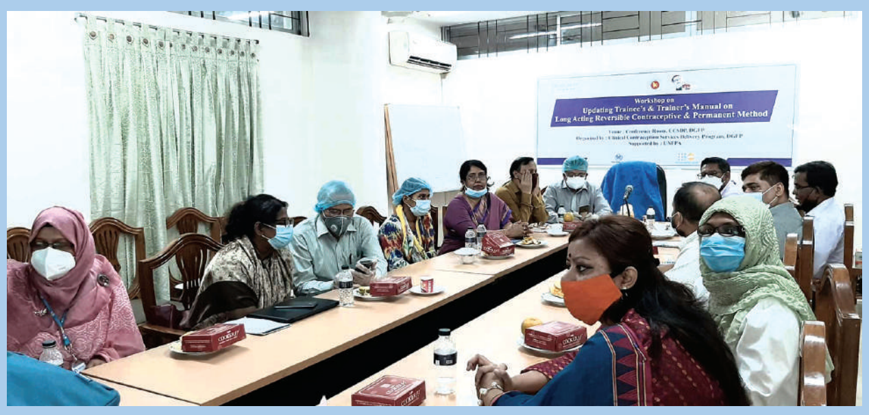
Orientation on 'Disability Inclusive SRH' for technical working group members

One of the main objectives of signing this MoU was to strengthen individual knowledge and choice, build community support for Sexual and Reproductive Health Rights (SRHR), and foster disability inclusiveness. Handicap International (HI) realized that the key actors to achieve this at service level are policy makers and UN agencies (such as UNFPA).