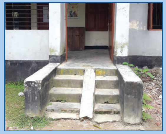
Main entrance of a facility compound in the Sitakund Upazila, as not user friendly for wheelchairs, crutch users and white cane users @ HI