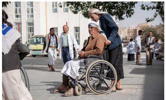
Sana'a residents, including persons with disabilities, 2019.

The destruction of schools and education services will undermine children's futures long after the conflict ends. As of 2019, an estimated 2000 schools are unfit for use due to the conflict, during which 256 schools were destroyed by explosive weapons , including airstrikes or shelling . (95) Another 167 schools were not in use because they were being used to shelter IDPs fleeing the conflict . Children are also some of the most