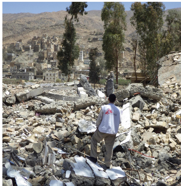
Hayden Hospital in March 2016 after months of airstrikes.

Yemen's health system cannot afford the severe and long-lasting reverberating impact of explosive weapons use. An estimated 19.7 million people lack access to adequate healthcare. (47) At the same time, 49% of Yemen's health facilities are no longer fully functional. (48) Medical specialists and health workers are also scarce in Yemen, with only ten health workers per 10,000 people. (49)