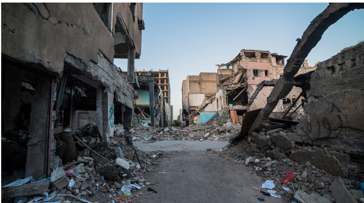
Aden, destruction by airstrikes. October 2017.

Yemen has limited water resources and weak water infrastructure. Over 90% of Yemen is considered to possess an arid to hyper-arid climate with limited groundwater resources. (64) Before the conflict, water infrastructure was also underdeveloped, with only 52% of Yemenis having access to safe drinking water. (65) Now after years of conflict, over two-thirds of the population require WASH support to meet their basic needs in Yemen. (66) Of this number, 12.6 million are in acute need. (67)