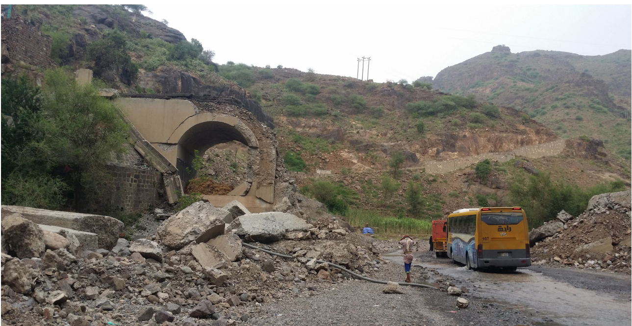
A bridge on the Sana'a – Hodeidah road damaged by airstrike. June 2017.