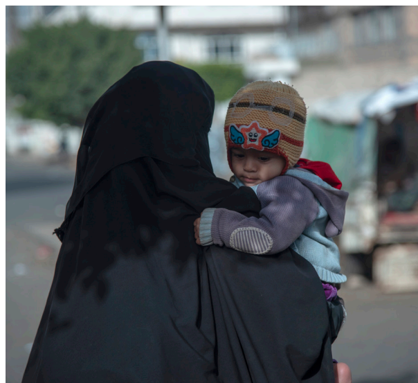
A mother carrying her child in Sana'a, 2019.

Persons with disabilities are also among the most marginalised in crisis-affected communities. (86) Services for persons with disabilities are often disrupted by conflict, and in the case of Yemen, resources available for this group have decreased substantively in the past five years. Persons with disabilities are disproportionately impacted by damage to health services and increasing risks