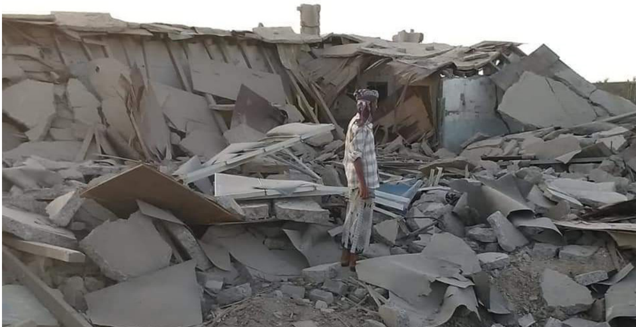
Destroyed telecommunications Center on Kamaran Island in Hodeidah Governorate. March 2020.

Over 50% of Yemenis (16 million people), are severely food insecure. (26) In a crisis, food security is largely driven by economic and access factors. The use of explosive weapons in populated areas and near critical infrastructure can have a