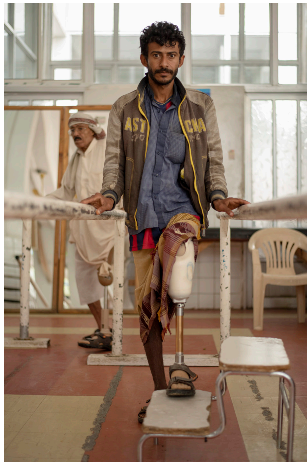
Physical therapy at a HI supported Sana'a rehabilitation center.

Due to the inaccuracy inherent in their design and use, some explosive weapons have wide area effects that cause death, injuries, wide-scale destruction of infrastructure, and long-term contamination that have an indiscriminate impact on civilians. As evidenced in this report on the Yemeni context, parties to the conflict,