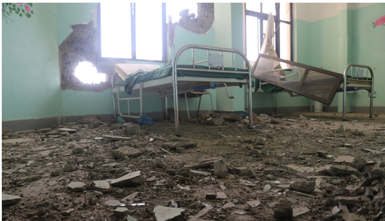
Al-Joumhuri Hospital in Taiz February 2016.

The destruction of health facilities by explosive weapons immediately reduces access to health facilities for people in crisis and increases the population's vulnerability to malnutrition, water-borne diseases, and life-long impairments from conflict-related injuries. (60) The World Bank has identified the disruption of immunisation campaigns, the spread of diseases facilitated by vulnerability caused by malnutrition, inadequate water and sanitation, and an increasing vacuum of services caused by health staff deserting due to insecurity as impacts from the conflict. (61) Though not all of these impacts can be attributed solely to explosive weapons, the destruction of even a few health facilities in this context contributes to the worsening public health situation in Yemen.